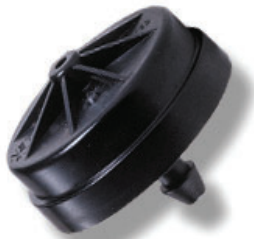
PRESSURE COMPENSATING (PC) NON CNL

MAINTAINS A UNIFORM FLOW RATE WITH THE WIDEST COMPENSATION RANGE - 7 TO 58 psi