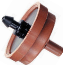
WOODPECKER PRESSURE COMPENSATING (WPC) WITH CNL