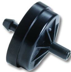
WOODPECKER PRESSURE COMPENSATING (WPC) NON CNL