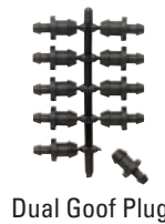
Dual Goof Plug