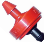
WOODPECKER PRESSURE COMPENSATING JUNIOR (WPCJ) WITH CNL