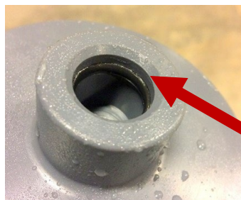
Interior O-Ring [Membrane Side]